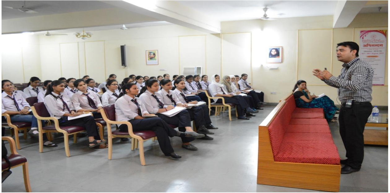
Students actively taking part in the session